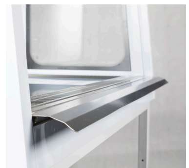
Optional Arm Rest

All components have low energy consumption, LED lighting and an EC fan motor. The system also has a programmable "green" night mode, that shuts down all unnecessary electricity consumption and sets vital components at the required safety level.